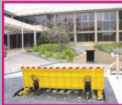
Vehicle Access & Control