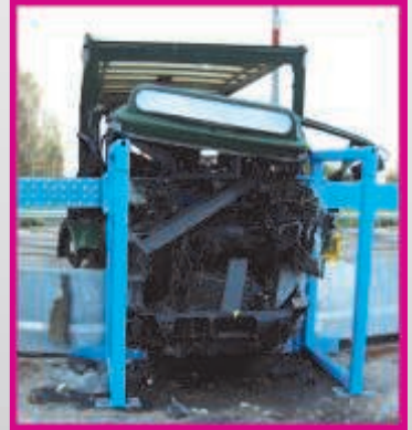
High Performance Perimeter Barriers