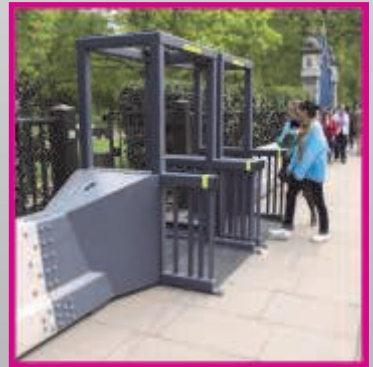
Pedestrian Access & Control