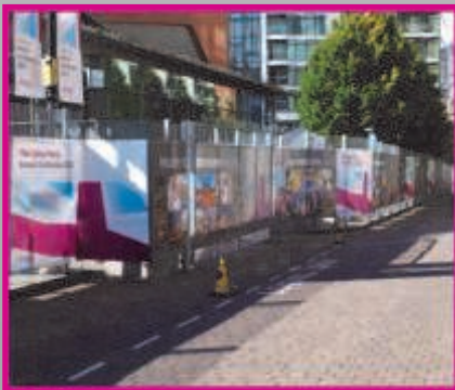
Rapidly Deployable Event Fencing