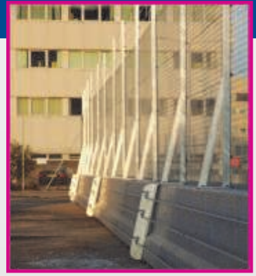
Perimeter Barriers & Security Fencing